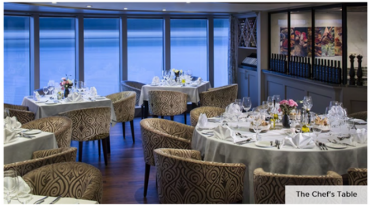
The Chef's Table