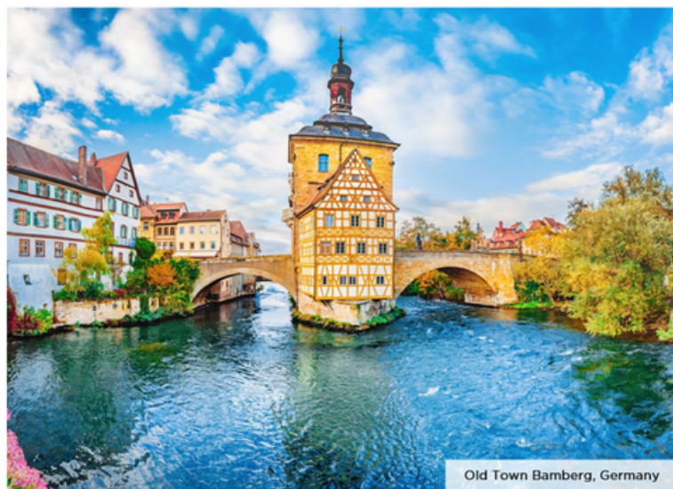
Old Town Bamberg, Germany

Stay for his awesome Amsterdam post-cruise package.