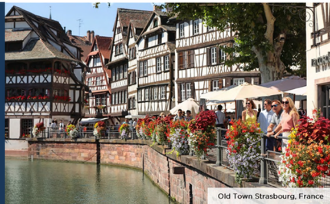
Old Town Strasbourg, France

09/12/2023 WASSERBILLIG, LUXEMBOURG TO 09/19/2023 BASEL, SWITZERLAND TO 09/26/2023 NUREMBERG, GERMANY